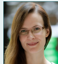
Catherine Talks London Stock Exchange (LSEG)