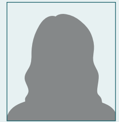
Sandy Hoyland, Chartered FCSI Schroders Personal Wealth